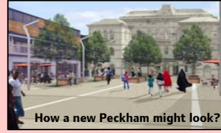
How a new Peckham might look?

You'll know that I have been a strong supporter of the Peckham Programme's plans to re-vamp Peckham Rye Station. I'm pleased to say that a new report on how this project can be taken forward will be launched in November! More updates to follow—this is an exciting development.