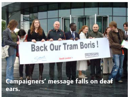
Campaigners' message falls on deaf ears.

I recently led a cross-party deputation to the Mayor including councillors and Assembly Members from four boroughs to lobby for the Tram and in Committee I have also been working to promote trams as a great form of transport. Over the summer the committee visited Croydon Tram Link's Therapia Lane depot. I was Leader of Croydon council when the Tramlink was being implemented and it's clear how very successful and popular the scheme is, despite the initial opposition to it. Not only has it improved transport links but has helped the Croydon economy by