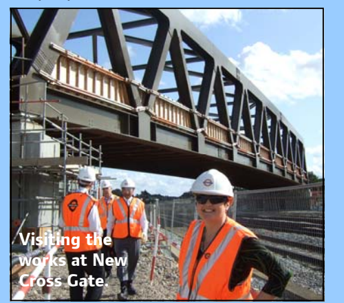
Visiting the works at New Cross Gate.

The current works are only Phase 1 of the proposed extension and I am